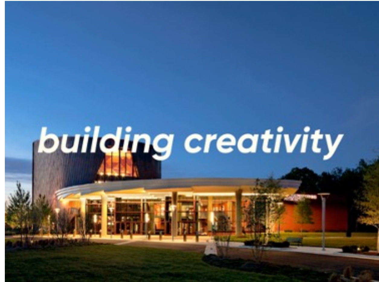
Photo credit: Hylton Performing Arts Center, Prince William, VA, with the text, "building creativity" written across the center of the photograph